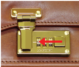
Button - Change Combination Position

If you need additional assistance, please contact us directly.