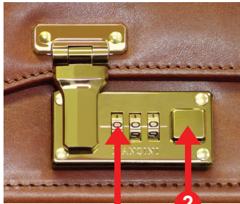
1 Dials 2 Button Normal Position

Note: Remove and discard the red plastic insert from the dials.